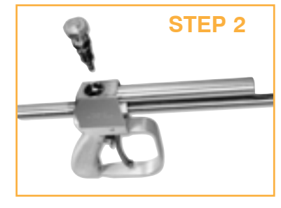
Align lobe on cartridge assembly with groove in cartridge adapter and turn counter clockwise to unlock and remove.