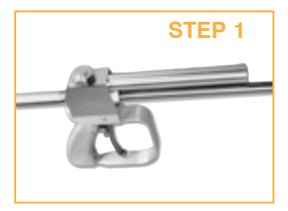
Remove cartridge adapter

Lighter and ergonomically redesigned for operator comfort and safety.